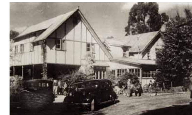
Kooringa, c. 1940s