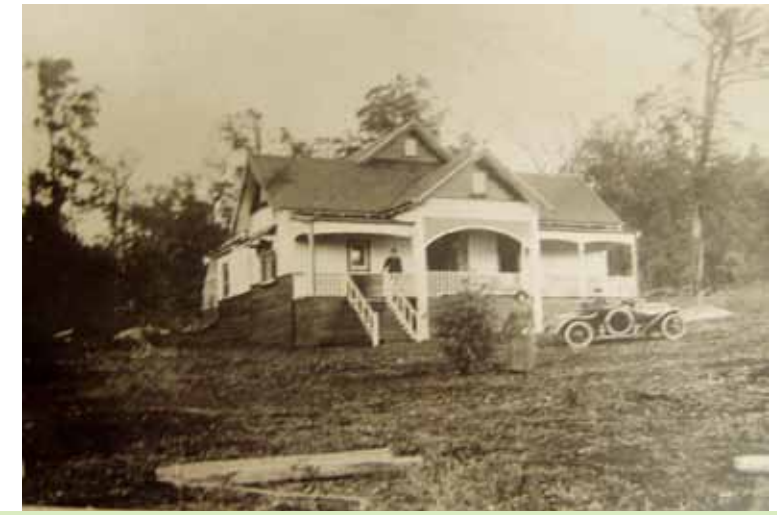
Kooringa, c. 1913-20

KOORINGA WHILE IT WAS STILL A PRIVATE HOME.