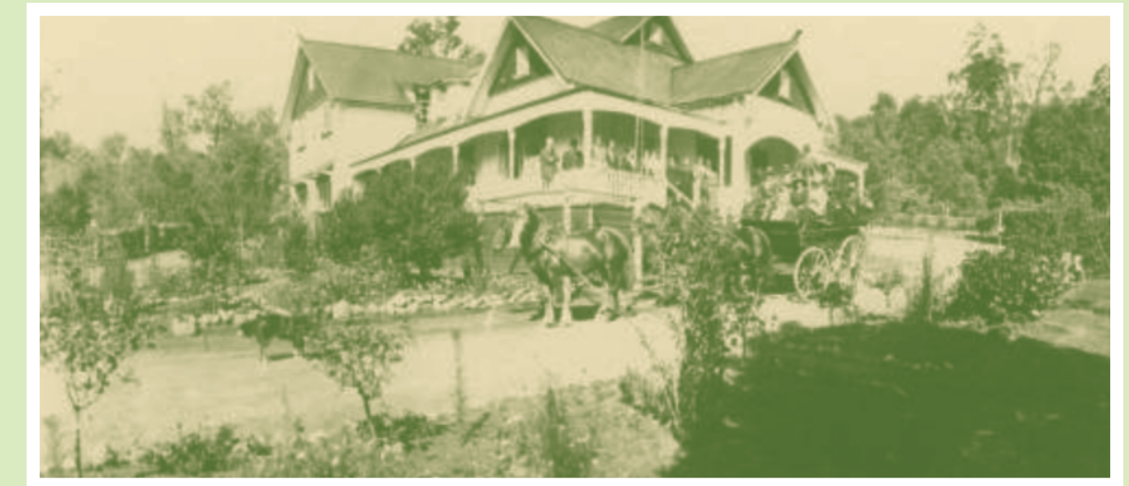
Kooringa, c. 1925