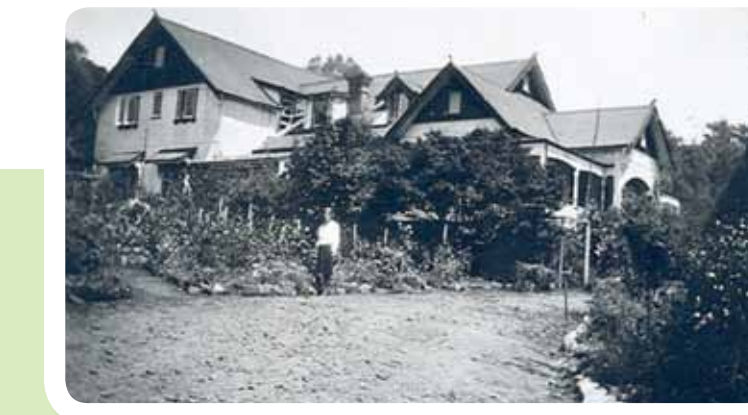
Kooringa, c. 1940