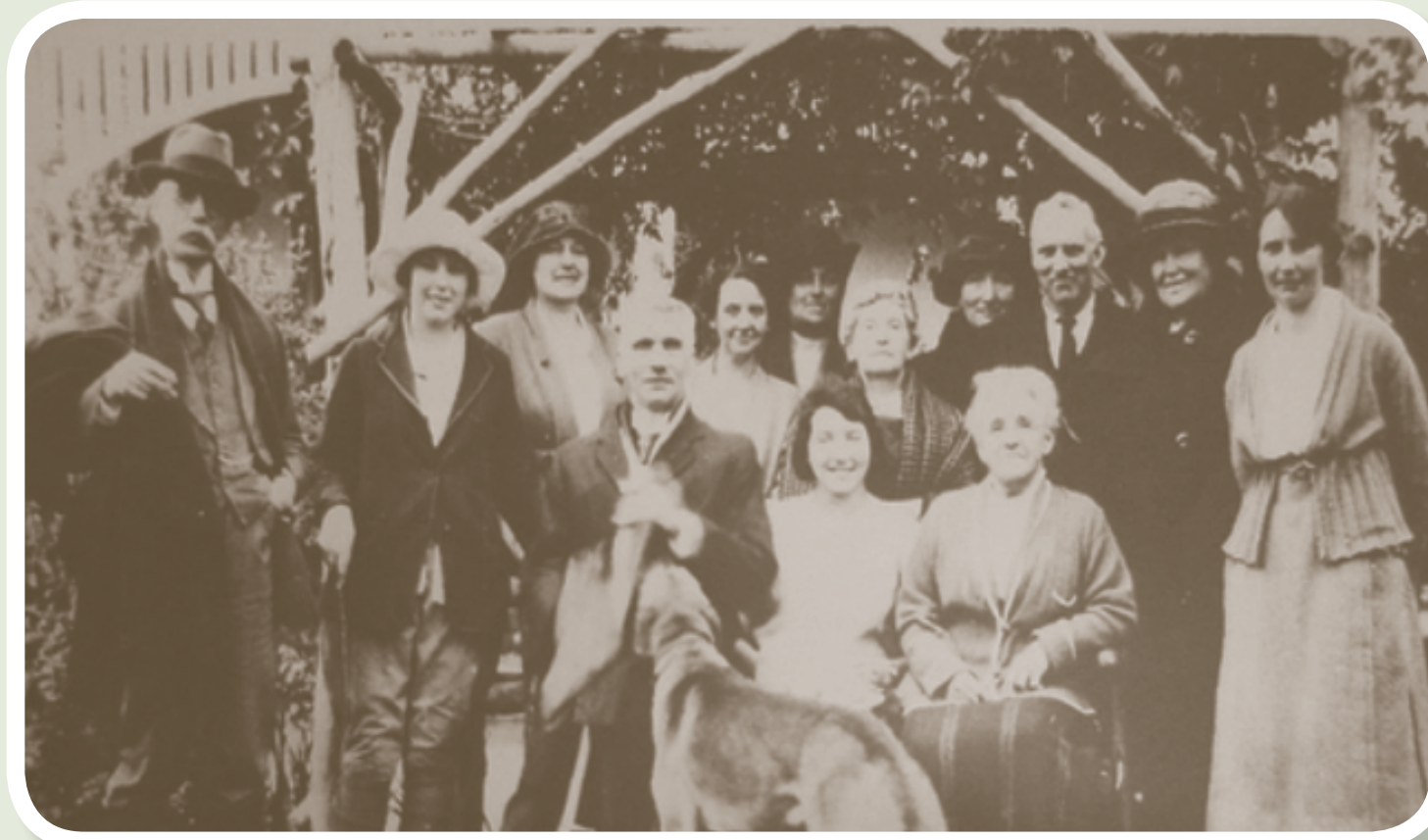
Under the rose arch at Kooringa, c. 1920s