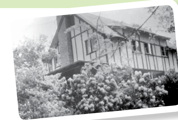
Kooringa, c. 1940-60